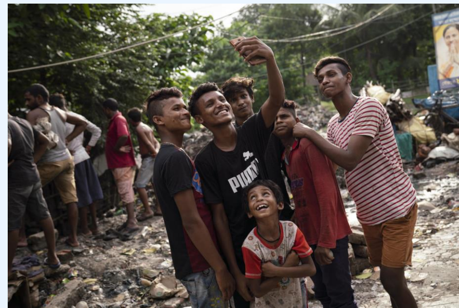
The boys in the photo are not related to the project

The goal of the project is that by the end of the project in 2023, the state of West Bengal will be better equipped to provide preventive services for children at risk of abandonment or separation from their families. The project aims to achieve lasting effects, including reduced crime and delinquency among children, increased child-friendliness of authorities in dealing with criminal cases involving children, more resilient children and families, and better prospects for vulnerable children.